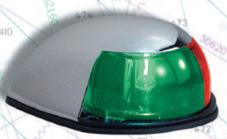
Fig. 229 Bi-Color Light